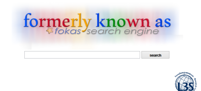
FIGURE 2: fokas search page.

period where both terms experience an increase or decrease in frequency without taking into consideration the absolute values. The rank correlation is normalized by the total number of time periods. The normalized rank correlation considers the same agreements but is normalized with the total number of time periods where both terms have a non-zero term frequency.