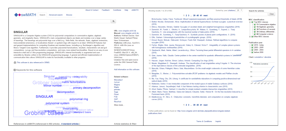
Fig. 1: Record of the mathematical Software Singular on swMath

up-to-date representation of the SW, it introduces inconsistencies with included publications, which are annotated with the year of publication and constitute temporal witnesses of different SW states. Therefore, it has been considered to integrate temporal information in order to represent the different versions of a SW over time and match publications. Web archives can serve as source for this information in the future.